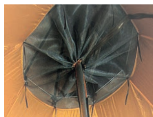
Closable insect net.