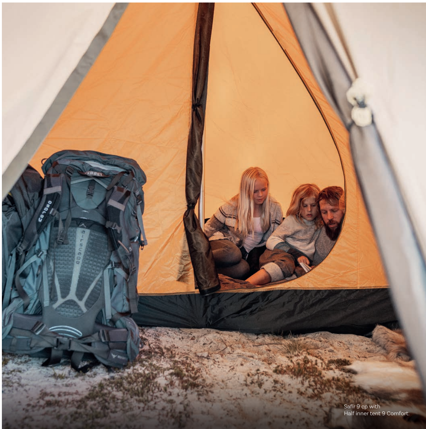
Safir 9 cp with Half inner tent 9 Comfort.