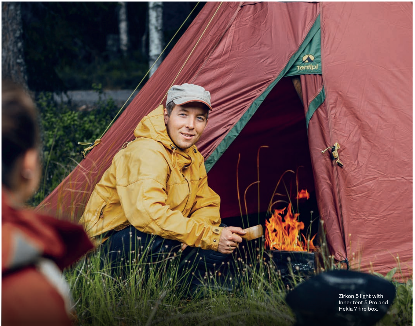
Zirkon 5 light with Inner tent 5 Pro and Hekla 7 fire box.