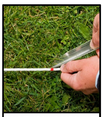
PULL OUT THE MEASURING CORD AND PUT A TENT PEG BY THE RED MARKING.