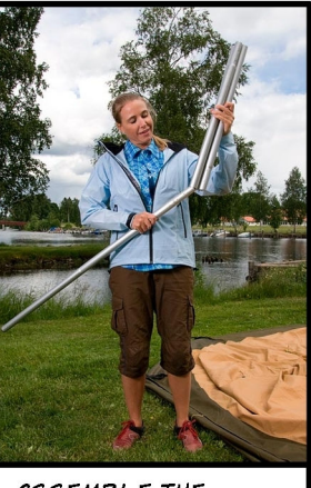
ASSEMBLE THE CENTRAL POLE.