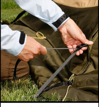
TIGHTEN THE GROUND STRAPS ALL THE WAY ROUND. ADJUST THEM TILL YOU ARE SATISFIED.