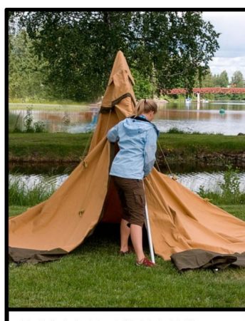
RAISE THE NORDIC TIPI.