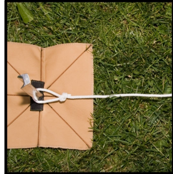
USE A TENT PEG TO PIN DOWN THE MOUNTING CROSS WHERE THE CENTRE OF THE NORDIC TIPI IS TO BE-