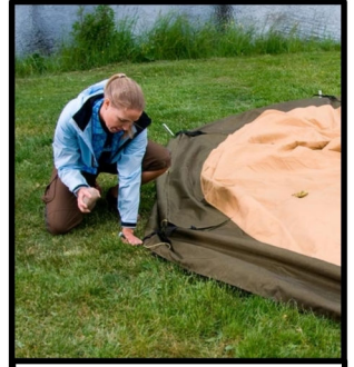
SPREAD THE NORDIC TIPI OUT AND PULL THE GROUND RINGS OVER THE TENT PEGS. PUSH OR HAMMER THE PEGS ALL THE WAY DOWN.